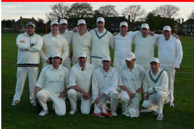
Corinthian Jedi CC 2008