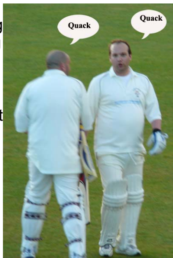
The Duck Brothers