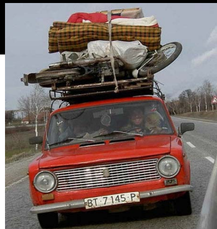
Jedi on the move

The Corinthian Jedi are on the move, after 4 seasons playing cricket at 'Fortress' Clee Road the Jedi have moved their home ground to King George V fields. After 26 home matches played incorporating 7 wins, 2 draws & 17 losses maybe the Fortress tag is a bit of an exaggeration. But the Corinthian Jedi will miss having the worse ground in the league. RIP Fortress Clee road