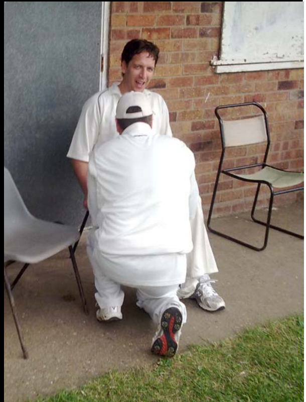
Relieved - The Wookiee is relaxed